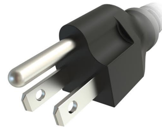
Standard configuration: Nema 5-15 Connector

To order with the optional M12 connection, simply place M12 after the part number listed above.