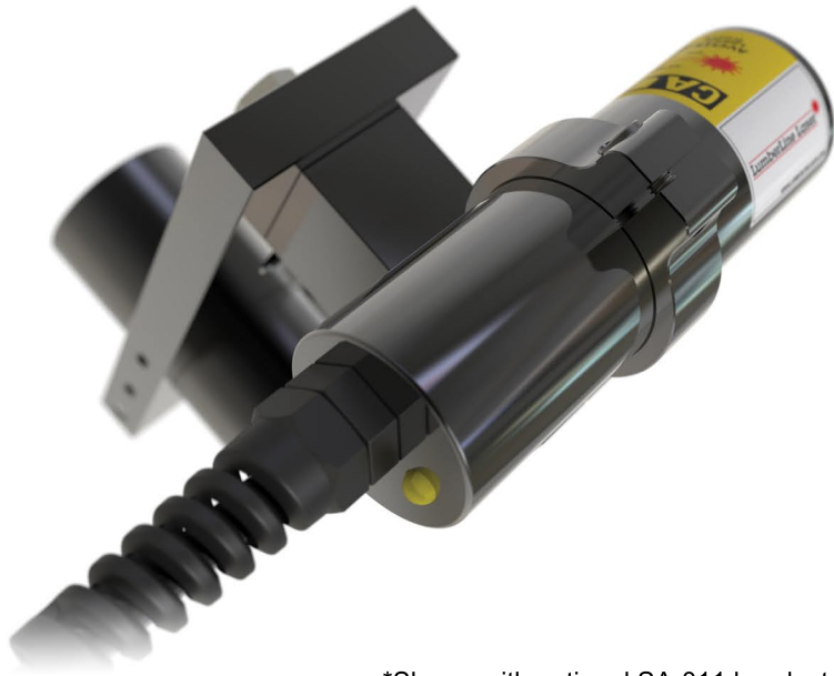
*Shown with optional SA-011 handset slider

The lasers work with all of our standard brackets and positioning assemblies.